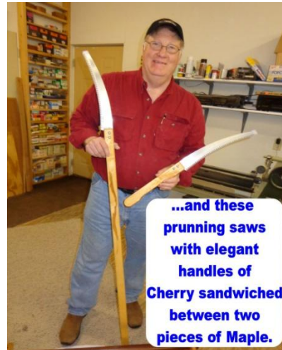
...and these pruning saws with elegant handles of Cherry sandwiched between two pieces of Maple.

Three band saws were available to cut the pieces to shape, two drill presses, a boring machine, two router tables, sanding belt, chop saw, and various drills, hand tools, glue and clamps.