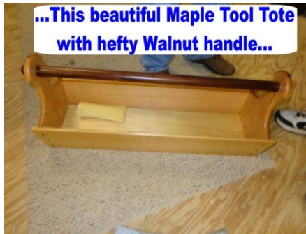
...This beautiful Maple Tool Tote with hefty Walnut handle...