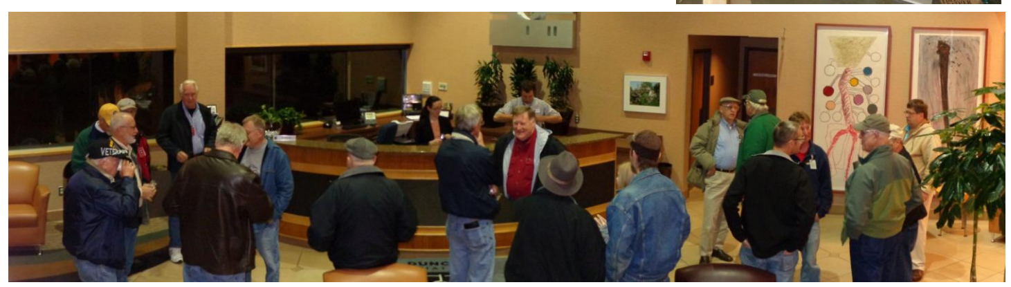
Woodworkers Guild 5